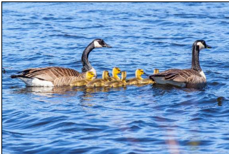
New family of geese on Nelson Lake!

Winner of the raffle with be drawn at the NLA Annual Picnic on Saturday, August 13 at Nelson Lake Landing Resort