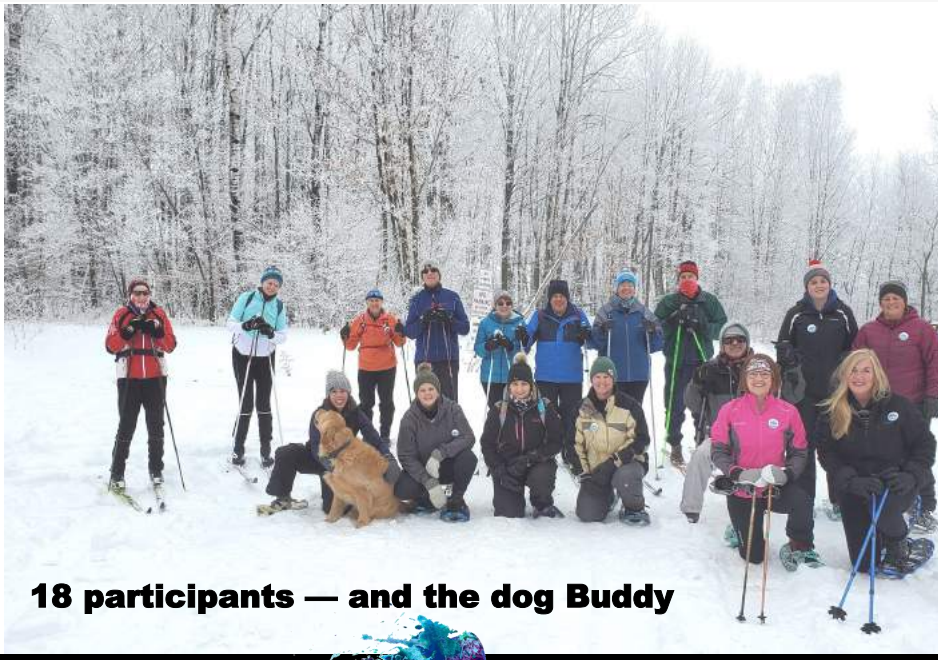
18 participants — and the dog Buddy